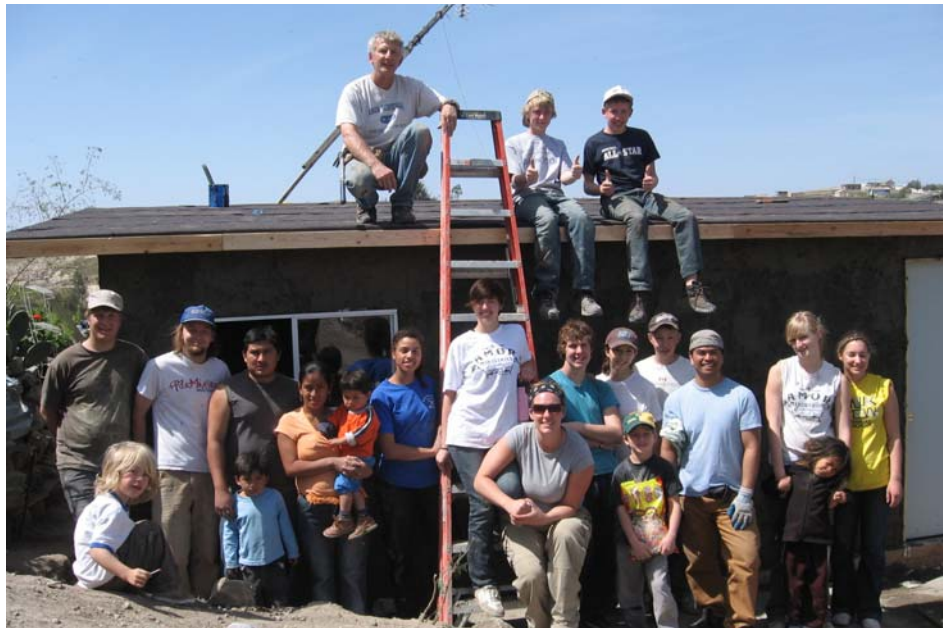
BBC Missions Committee